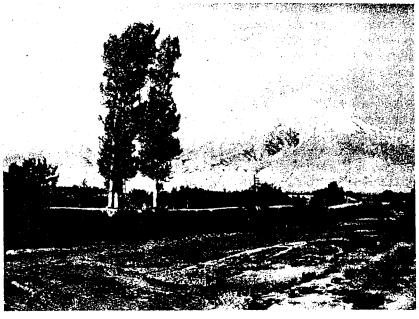
Mount Ararat in Armenia

"The main Armenian plateau lies at an average height of between 4,500 and 5,500 feet above sea level," writes David Marshall Lang. "Almost everywhere, Armenia is higher than the countries which immediately surround it. Cut off from them on virtually all sides by barriers of lofty hills and mountain peaks, Armenia seems like some massive rock-bound island rising out of the surrounding lowlands, steppes and plains." The Armenian people are descended from a sturdy mountain people who regarded their mountain peaks, comely hills, sparkling brooks and streams, and lakes and rivers as religious symbols of God's greatness and mystery. The physical environment of Armenia is a rugged wilderness, often totally hostile to human life. For thousands of years Armenians have used their skills to make this land inhabitable. The Armenian people have had to literally wrest their food from the stones of the Armenian mountains. The climate is varied and harsh, with the intensely freezing winds and snows of winter and the sometimes extreme dry heat of summer. Some areas have winter seven months of the year, whereas other areas, which have wooded mountains and hills, enjoy more moderate temperatures.